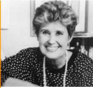
by Erma Bombeck